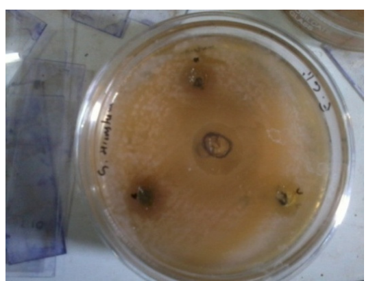
B. Escherichia coli PSGCAS Search: A Journal of Science and Technology Volume : 2 No. : 2, ISSN: 2349 – 5456