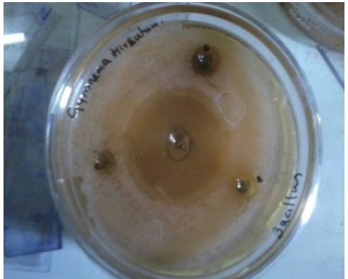
A. Bacillus subtilis