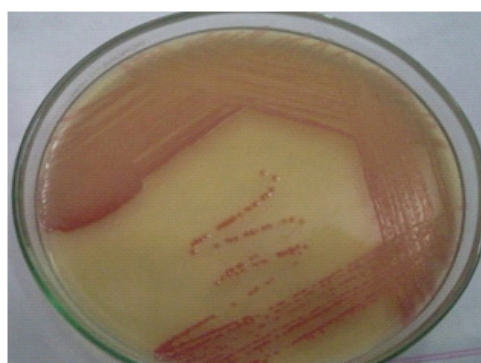
Fig. 1 : Trypticase soy agar medium showing red colour pigmented colonies

Prodigiosin production [7]: Cultures were grown in nutrient broth and peptone glycerol broth which are the most opted media for prodigiosin production. The production levels were estimated both at stationary and agitated phases to investigate the effect of aeration on production. The levels of prodigiosin in these conditions were estimated after 0hr, 24hrs, 48hrs, 72hrs, 96 hrs, 120hrs, and 144hrs.