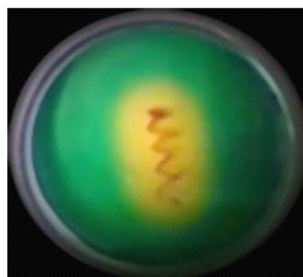
Fig. 3 : DNA hydrolysis shown by Serratia sp., on DNase agar media