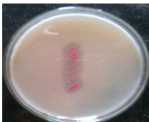
Fig. 2 : Nutrient agar medium showing red pigmented colonies