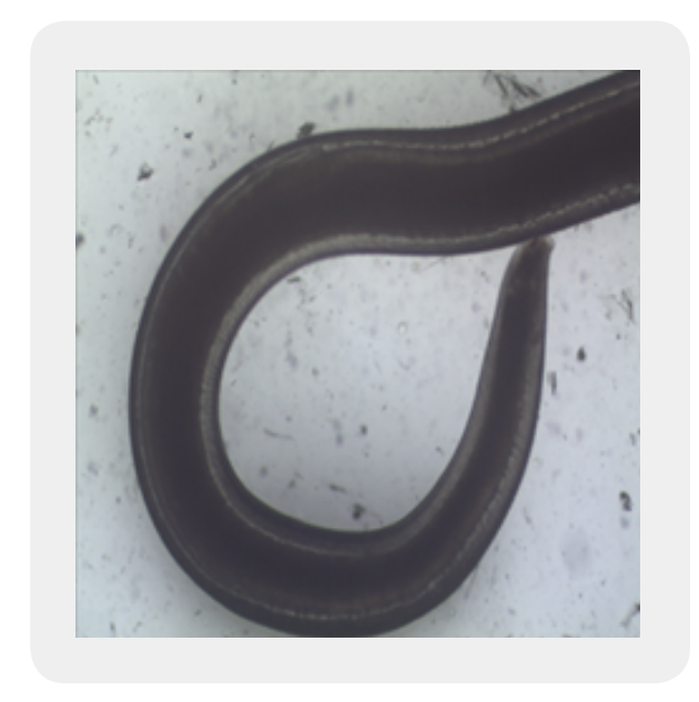
Fig 1: Anisakis sps.

The results are mean value of five individual's \pm standard deviation.