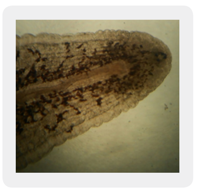
Fig 2: Hirudo sps.