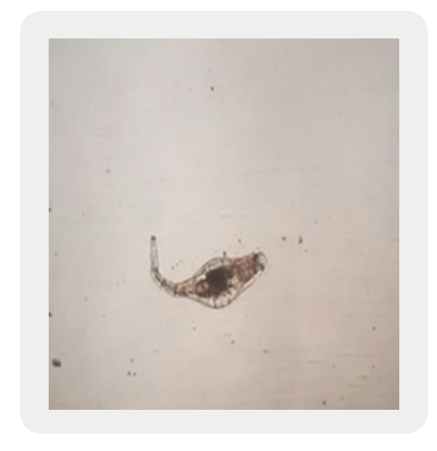
Fig 3: Rotifer sps.