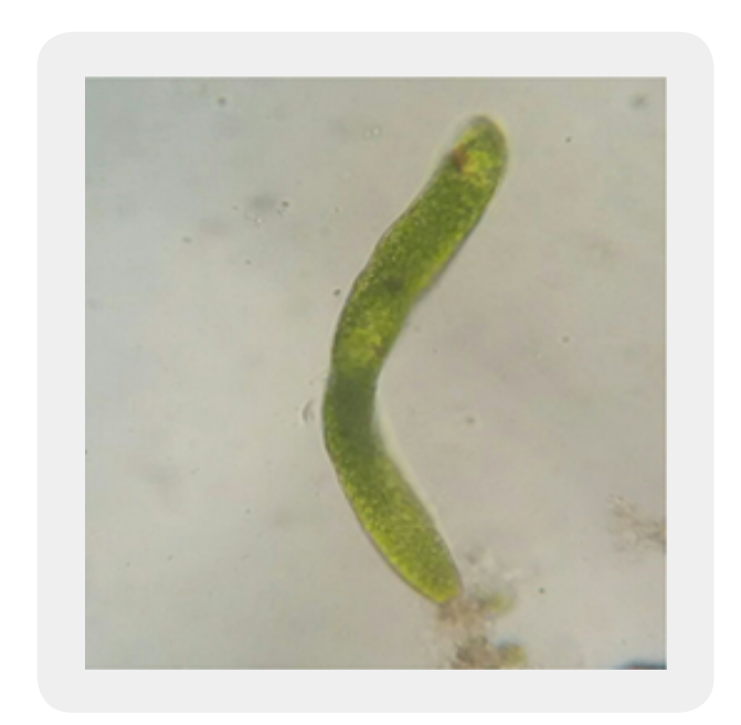
Fig 4: Protist