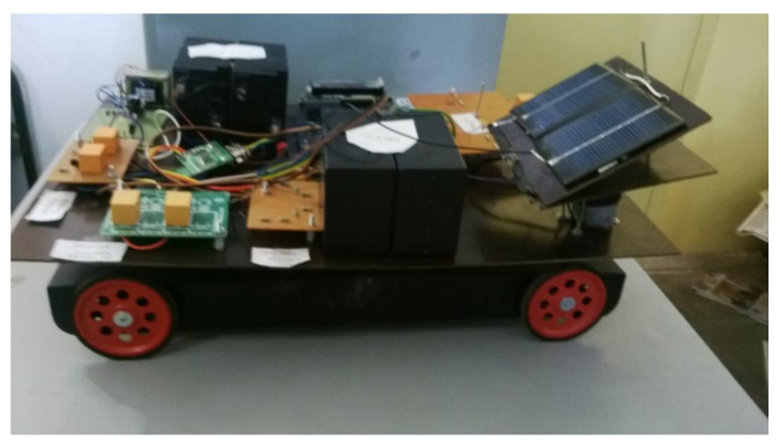
Figure 3. Hardware Assembly 2