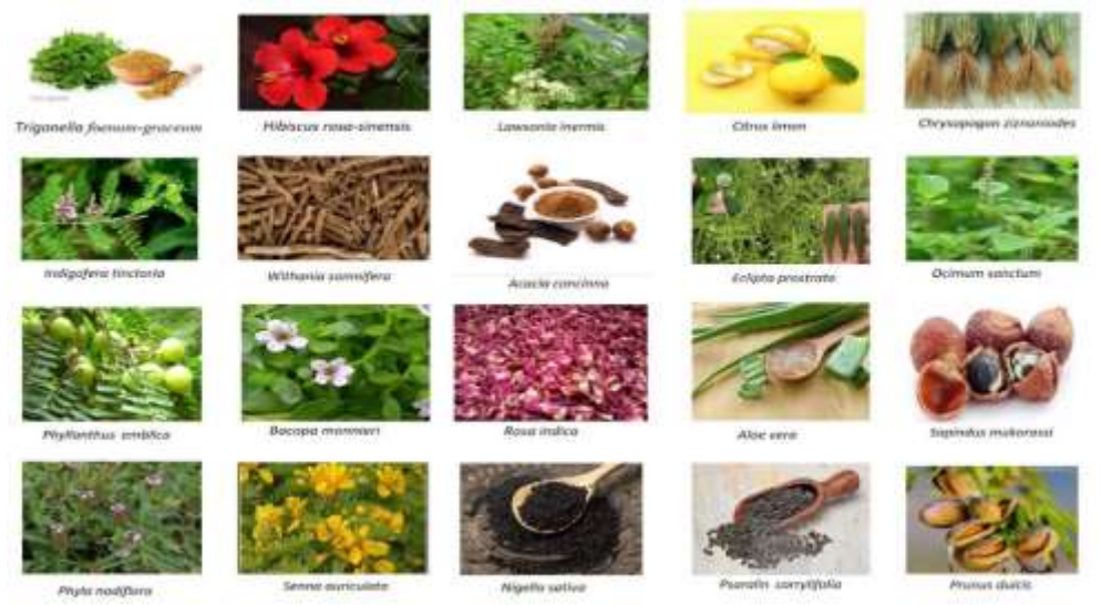
Fig.1: Plants used to formulate the polyherbal powder shampoo. Table 1: List of plants used in formulation of polyherbal shampoo powder

The polyherbal powder shampoo formulation were represented in Table.1 and Figure.1 The results of visual inspection for herbal shampoo powder were observed for odour, colour and taste and in terms of their flow property, appearance and texture. They are somewhat shows distinct change in colour.