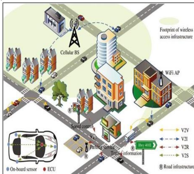
Fig. 2: Communication techniques expected to be used in VANETs comprising vehicles equipped with on-board sensors and electronic control unit (ECU); vehicle-to-vehicle (V2V), vehicle-to-infrastructure (V2I), vehicle-to-road side unit (V2R) and vehicle to sensors (V2S)

There have already been other major developments towards achieving “smartness” on the road. Multi-national enterprises around the world have made locating the parking slots easier through sensors (ParkSight [6]). This is allow the users to summon cabs through a single tap of a smartphone (Uber [7]) and designed a mechanism for volunteers to collect road traffic data for visualization (Streetbump[8]).