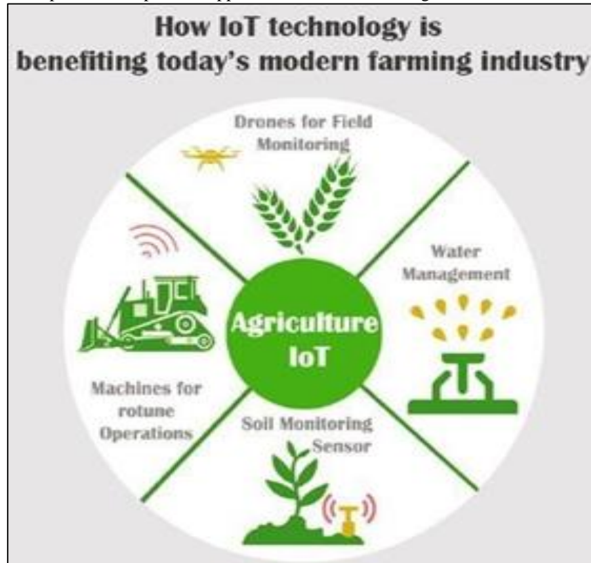
Fig. 3: Applications of IoT in agriculture

The world's water reservoirs are fast depleting and there is an urgent need to conserve this precious resource. According to an estimate, farmers use 70% of earth's freshwater, 60% of which is lost due to faulty irrigation systems, inefficient agricultural techniques and the cultivation of thirsty crops. Sensors and actuators can provide growers with a better visibility over their operation and thus allow them to minimize water wastage by monitoring metrics such as temperature and water pressure. In this respect, Microstrain [22] has developed a system of wireless sensors to gauge key conditions during the growing season in vineyards. The sensors measure variables such as temperature, soil moisture and solar radiation and alert the farmers in case of extreme conditions. Figure 3 spells out the possible applications of IoT in farming.