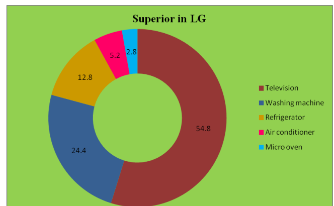
Exhibit 2: Exhibit Showing Superior Product in LG

It is evident from the study that out of the total respondents taken for the study, 49.2% of them have very high awareness towards television, 34.8% of them have very high awareness towards washing machine, 35.6% of them very high awareness towards refrigerator, 39.2% of them high awareness towards air conditioner, 38.8% of them less awareness towards microwave oven.